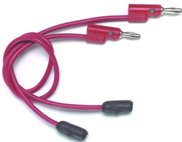
Model 4274 Multi-Stacking Banana Plug Patch Cord with In-Line Fuse Holder