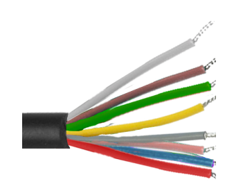
1 White 2 Brown 3 Green 4 Yellow 5 Gray 6 Pink 7 Blue 9 Red